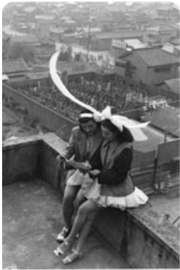
Dancers resting on the rooftop of the SKD Theatre. Asakusa, Tokyo