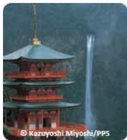
PHOTO EXHIBITION: THE WORLD HERITAGE IN JAPAN PART 1: JANUARY 28TH TUE. – FEBRUARY 22ND SAT. PART 2: FEBRUARY 25TH TUE. – MARCH 22ND SAT.