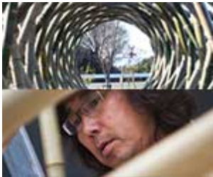
Exhibit: Bamboo Through September 9, 2018 Craft and Folk Art Museum $7 | free for members

BAMBOO explores the evolution of Japanese bamboo basketry from a purely functional art form into complicated, distinctly Japanese sculptural forms of variable scale. A major selection of historical and contemporary works from the Los Angeles-based Cotsen Collection are central to the exhibition, as well as a large-scale, interactive bamboo installation by Japan-based artist Akio Hizume.